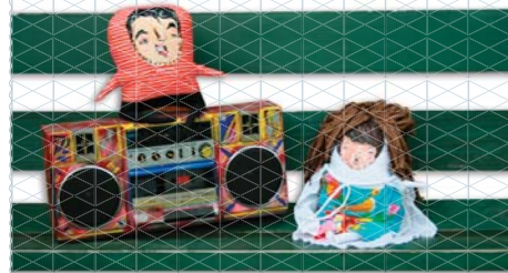
TOP: KINOO T-SHIRT